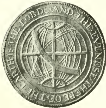
PREROGATIVE SEAL, 1801. Size - One inch and three-eighths in diameter.