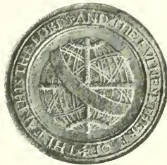
PREROGATIVE SEAL, 1765. Size—One inch and one eighth in diameter.