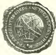
PREROGATIVE SEAL, 1699. Size—One inch and one-sixteenth in diameter.